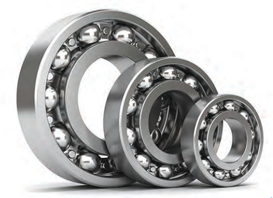
K-CORR G-1107 Performance in Lithium Complex Grease (NLGI #2)

As anti-rust requirements have increased, specific additives have been developed. K-CORR G-1107 is an ashless rust inhibitor designed to provide protection against severe conditions in most grease types. Shown below are results for a lithium complex grease.